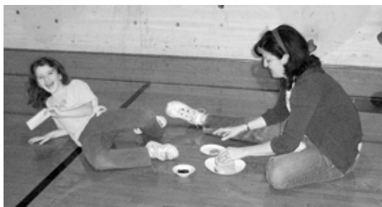
Above, a mother/daughter team practice communication skills at one of the workshops by verbally telling the other how to make a peanut butter and jelly sandwich... and have some fun in the process.

The project included three workshops: "Money Talks," "Reaching Together" and "Adventure." Each free workshop, which lasted about five hours, was open to adult/